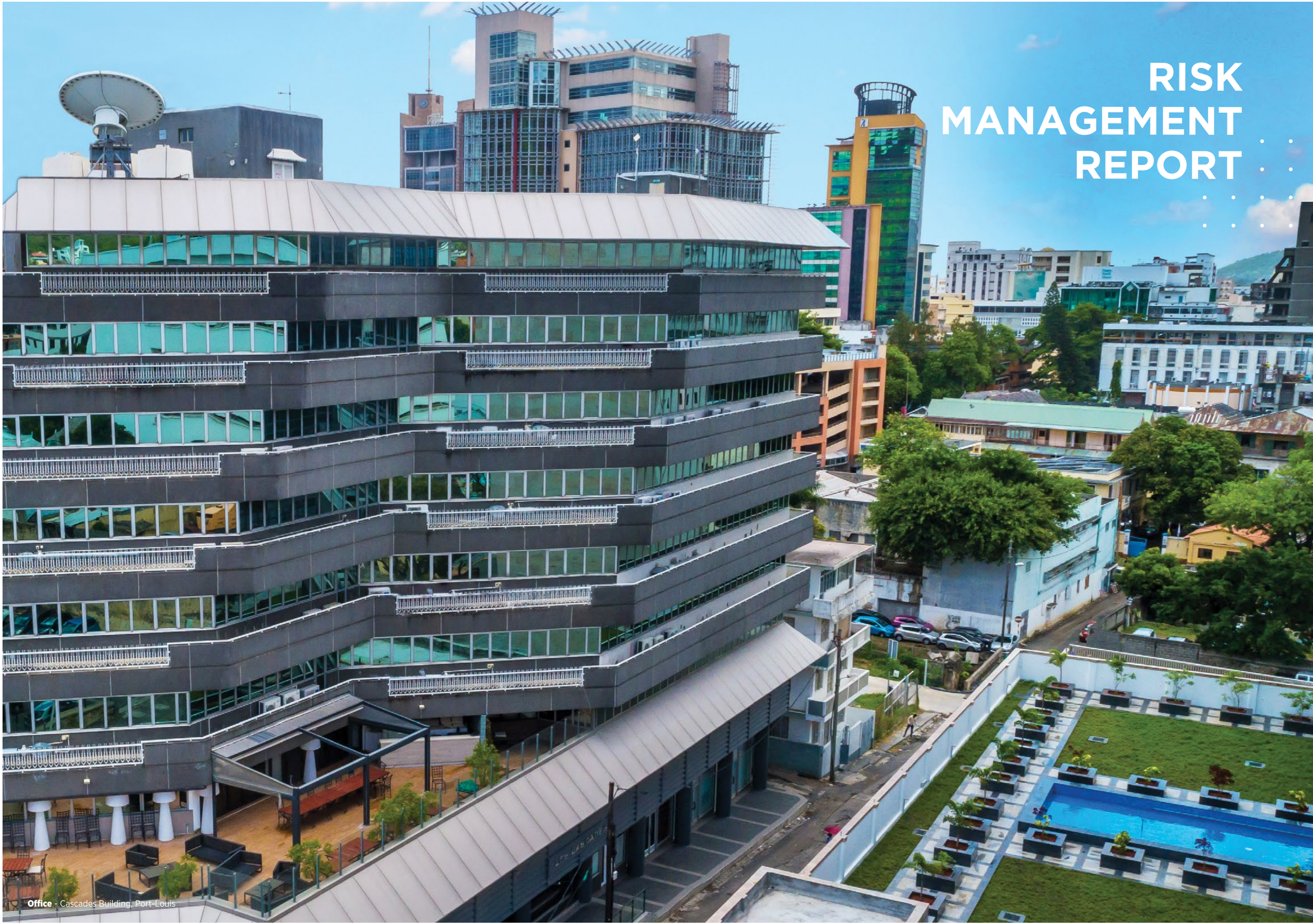
Office - Cascades Building, Port-Louis